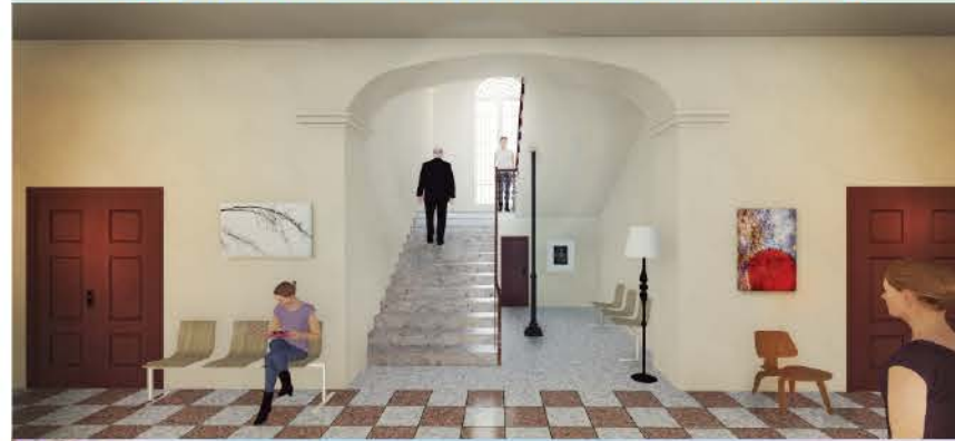
Detailed Design for the Restoration of the Italian Consulate, in Shkodra, under Italian Embassy