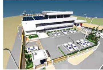
New Complex of Customs in Shkodra, under Contract with General Directorate of Customs in Albania