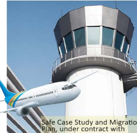
Safe Case Study and Migration Plan, under contract with Albcontrol