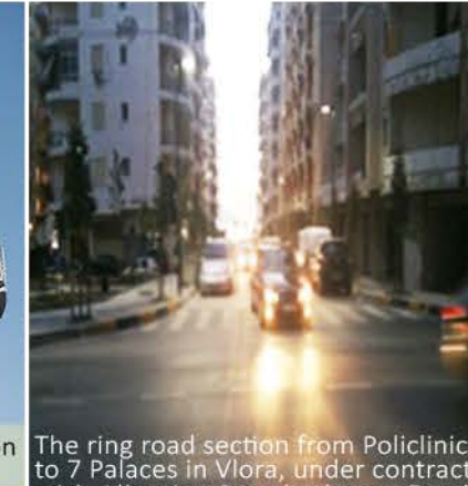
The ring road section from Policlinic to 7 Palaces in Vloa, under contract with Albanian Development Fond