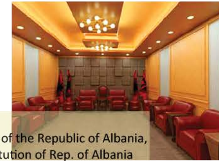
VIP HALL Presidency Building of the Republic of Albania, under Contract with the Institution of Rep. of Albania