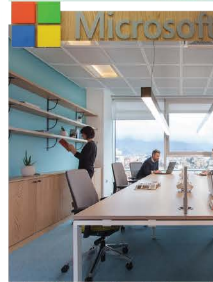
Real Estate Retail, Technical Due Diligence and Construction Management with Source8 ltd, UK