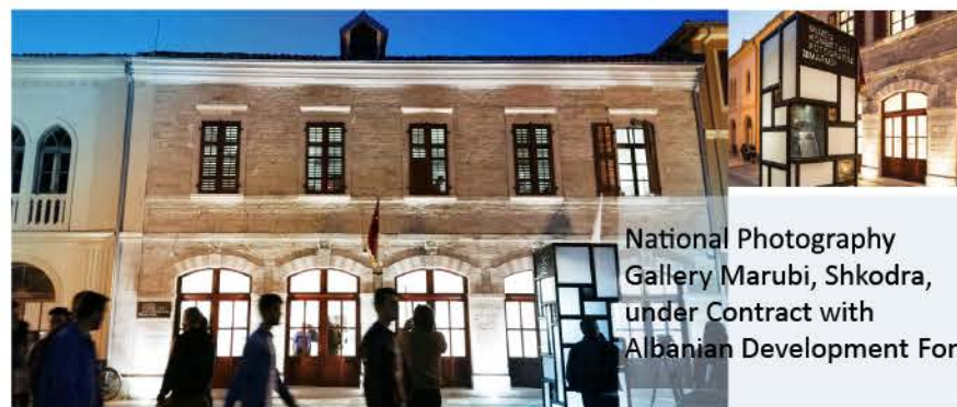
National Photography Gallery Marubi, Shkodra, under Contract with Albanian Development Fond